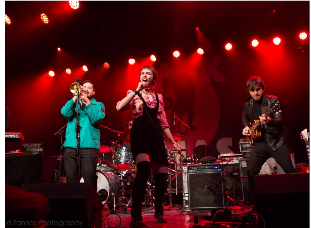
26 Bats in concert @ 6:30