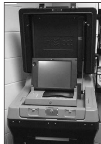
Pictured above: Precinct Ballot tabulators

The ePoll Book Pilot study was part of the Omnibus Election bill that was passed during the 2013 Legislative session. There are six cities within three counties participating in the study project. After the November 2013 election, the participating cities and counties will create a report and this will be presented to the ePoll Book Task Force by January 31, 2014.