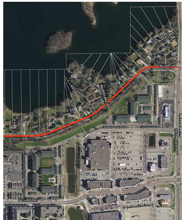
Proposed bituminous mill and overlay