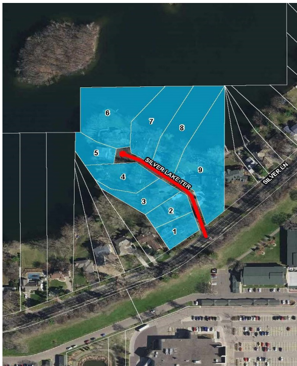
Street reconstruction image 2