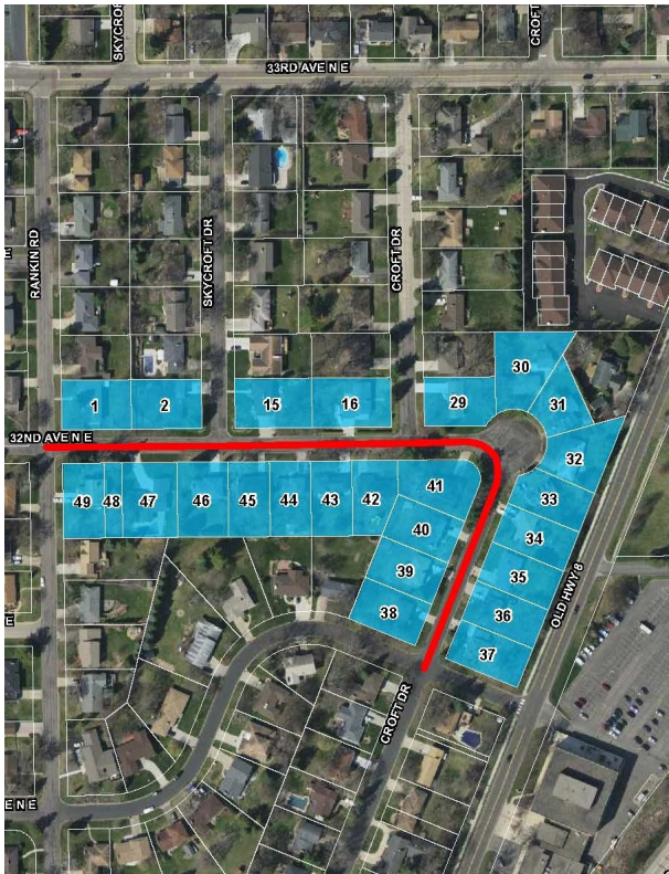
Street reconstruction image 1

Bids were received Jan.22. It is anticipated the Council will award the contract in April. Project documents are currently being executed with an anticipated start date of late April/early May, weather dependent.