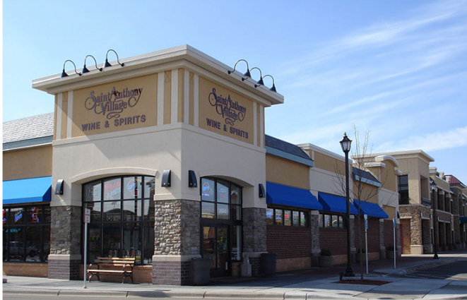
Silver Lake Village store, 2602 39th Ave. NE