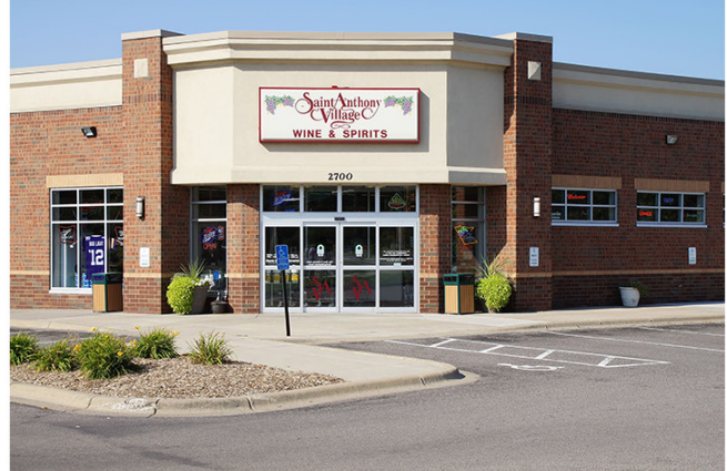
Marketplace store, 2700 Hwy 88

At St. Anthony Village Wine and Spirits, 100% of our profit enriches our community!