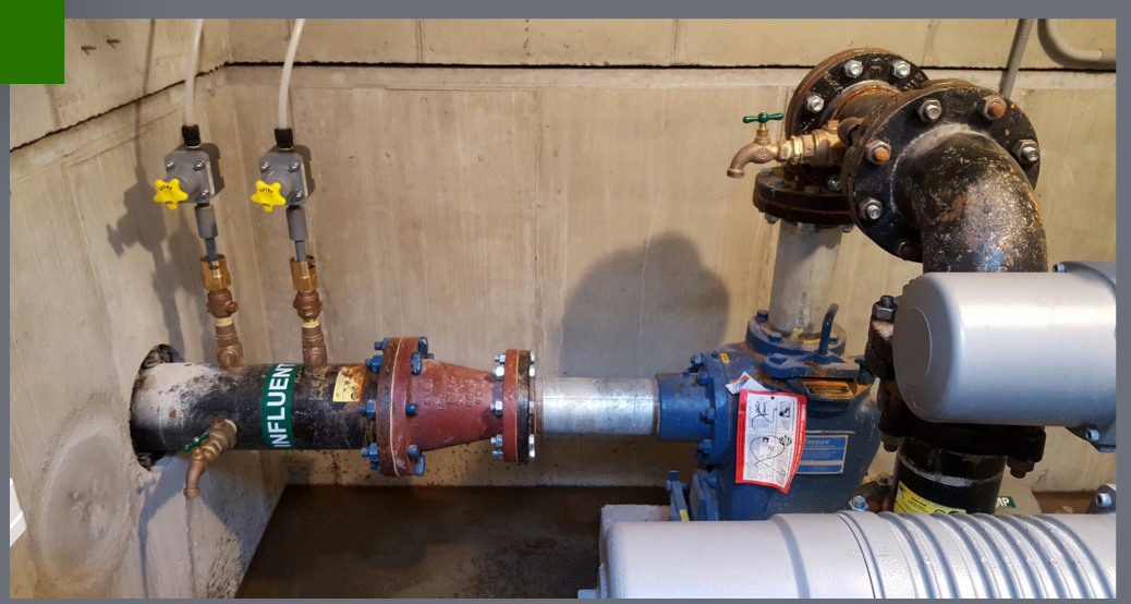
Chem Feed to Pre-treatment Water