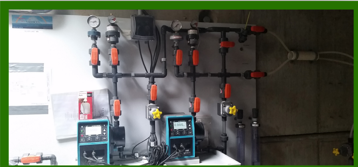
Alum Feed System