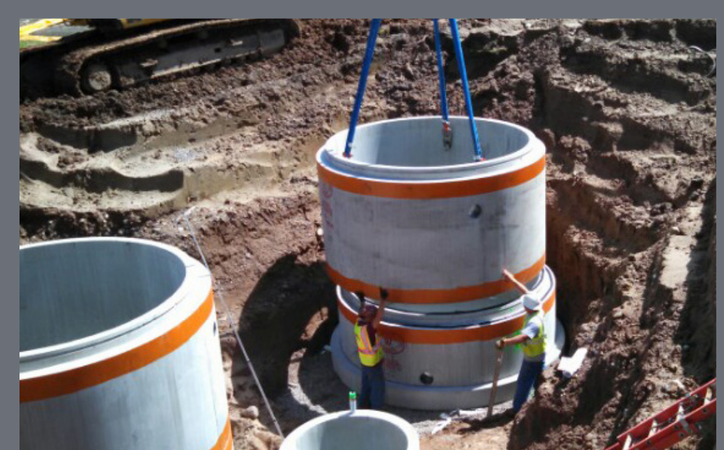
Construction of Clarifiers