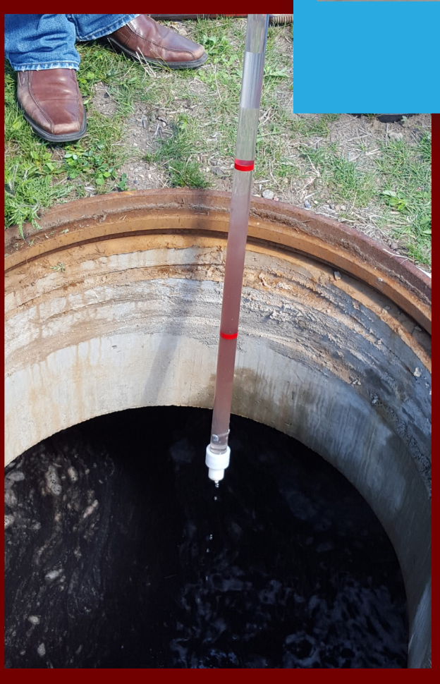
Sludge Discharge to Sanitary