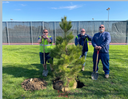
27 trees planted in city right-of-way and parks