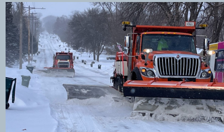
10 full city plow events

The Streets Department consists of six full-time staff and is responsible for the maintenance and repair of the approximately 25 centerline miles of city streets and 18 miles of sidewalks and trails within St. Anthony. These responsibilities include pothole repair, snow plowing, street sweeping, boulevard tree planting and maintenance, and sign installation and repair.