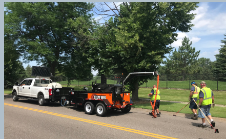
20 tons of asphalt to repair pavement