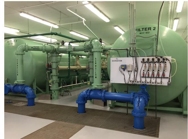
The WTP produces an avg. of 700,000 gallons of drinking water per day

Drinking water in the city is sourced from the Jordan Aquifer 500 feet below ground. Two wells pumping simultaneously pull the water into a transmission line that delivers the water to the Water Treatment Plant (WTP). The water is then treated by a three-step process to remove impurities, stored in a 2 million gallon reservoir, and pumped into the 250,000 gallon water tower before being delivered to residential homes and businesses. There are approximately 2,500 water service connections in the city.