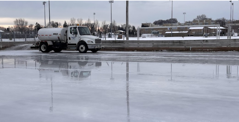
In the 2021-2022 skating season the city's ice rinks hosted 2,600 skaters

The return of athletic activities and social gatherings, splash pads and warming houses re-opening, and playgrounds busy with activity in the city's parks were a welcome sight for the department.