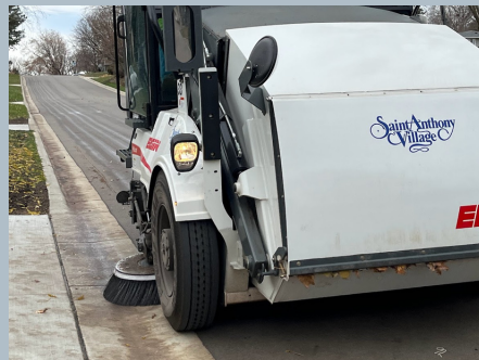
11 city-wide street sweepings