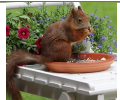
Feeding wild animals is prohibited