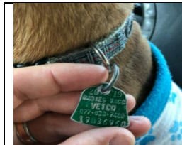
Required identification and proof of vaccination

City Code Section 91 contains sections specific to the keeping of animals, declarations of nuisances created by animals, and feeding of wild animals.