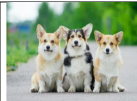
Owning 3 or more dogs requires multiple dog license